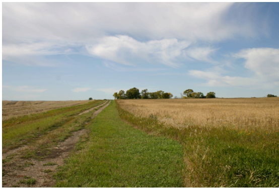
The Wakopa Village site in 2010 – the village was relocated here when the “Wakopa Branch” of the C.P.R. was build from Greenway in 1904.

In 1886 the CPR railroad reached Killarney and Boissevain, and Old Wakopa began to fade. Then in 1905 the Canadian Northern from the east gave it new life.